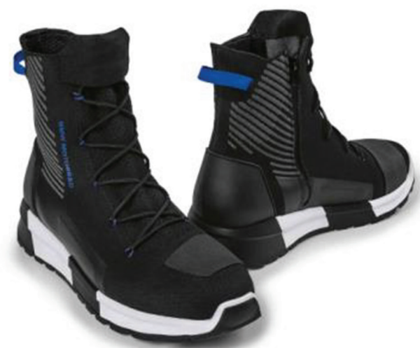
KniteLite Sneaker (men)