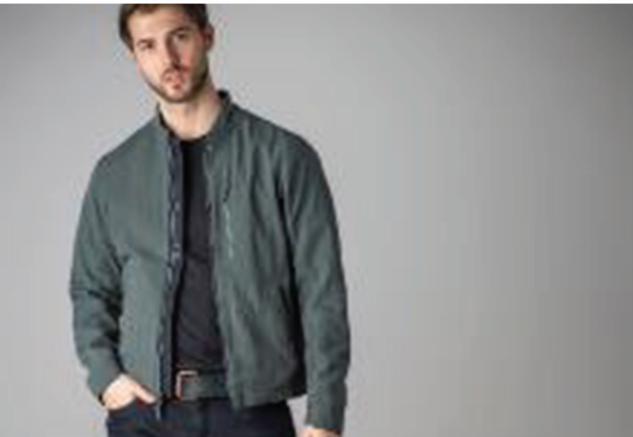
Transformer Jacket (men)