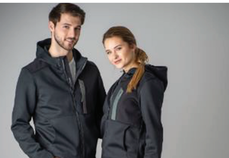
City Jacket (unisex)